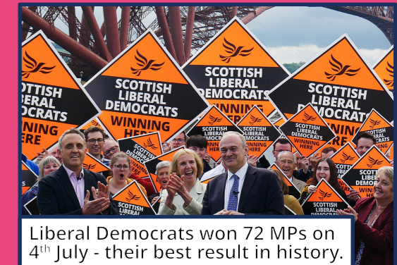
Liberal Democrats won 72 MPs on 4 th July - their best result in history.

Scottish Liberal Democrats are celebrating historic gains following the general election.