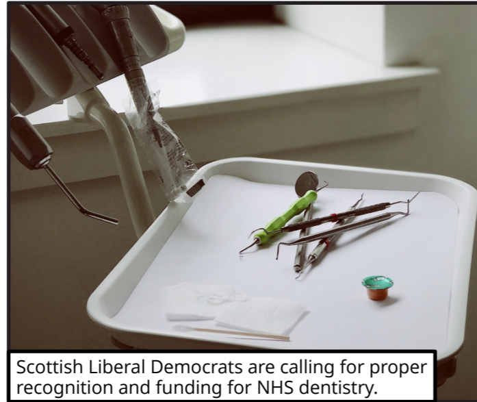
Scottish Liberal Democrats are calling for proper recognition and funding for NHS dentistry.