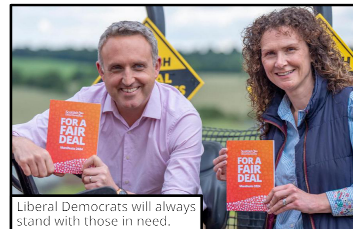
Liberal Democrats will always stand with those in need.

Renfrewshire Lib Dems are calling for the Two Child Limit on Benefit Payments to be scrapped.